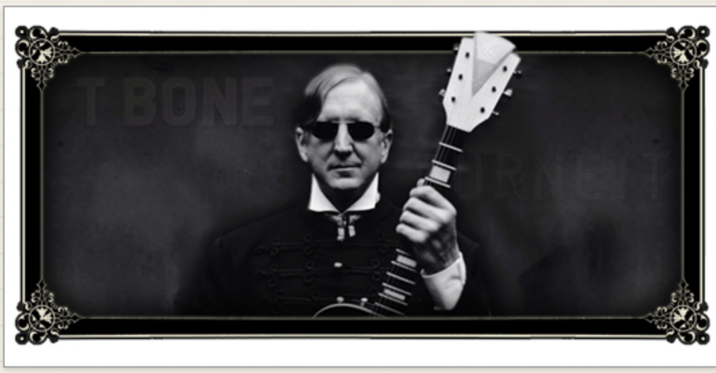
T Bone Burnett