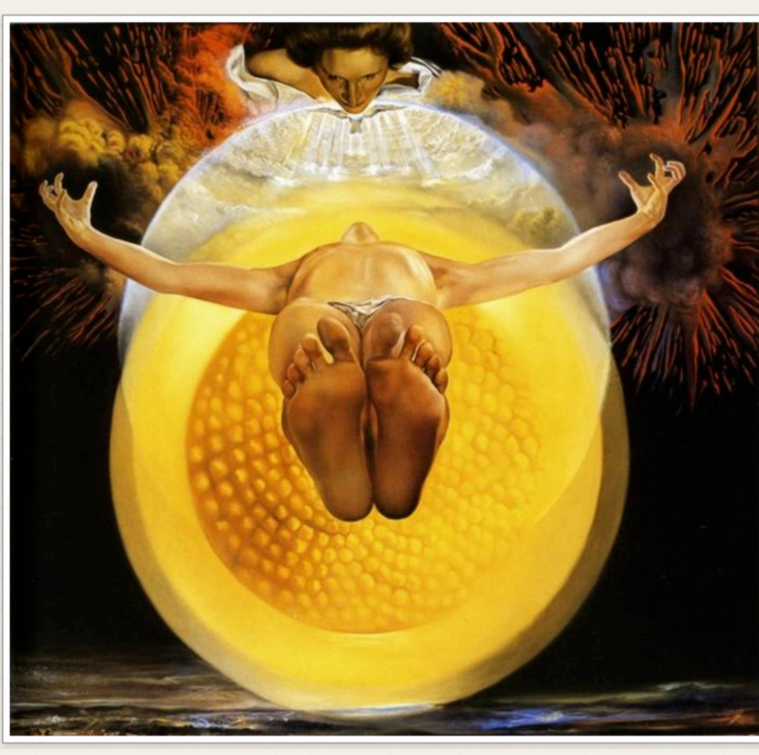
Dali ~ Ascension of Christ

THE WORLD REVEALS ITSELF TO THE SILENT LISTENER AND ONLY TO HIM; THE MORE SILENTLY HE LISTENS, THE MORE PURELY IS HE ABLE TO PERCEIVE REALITY ~ J. PIEPER