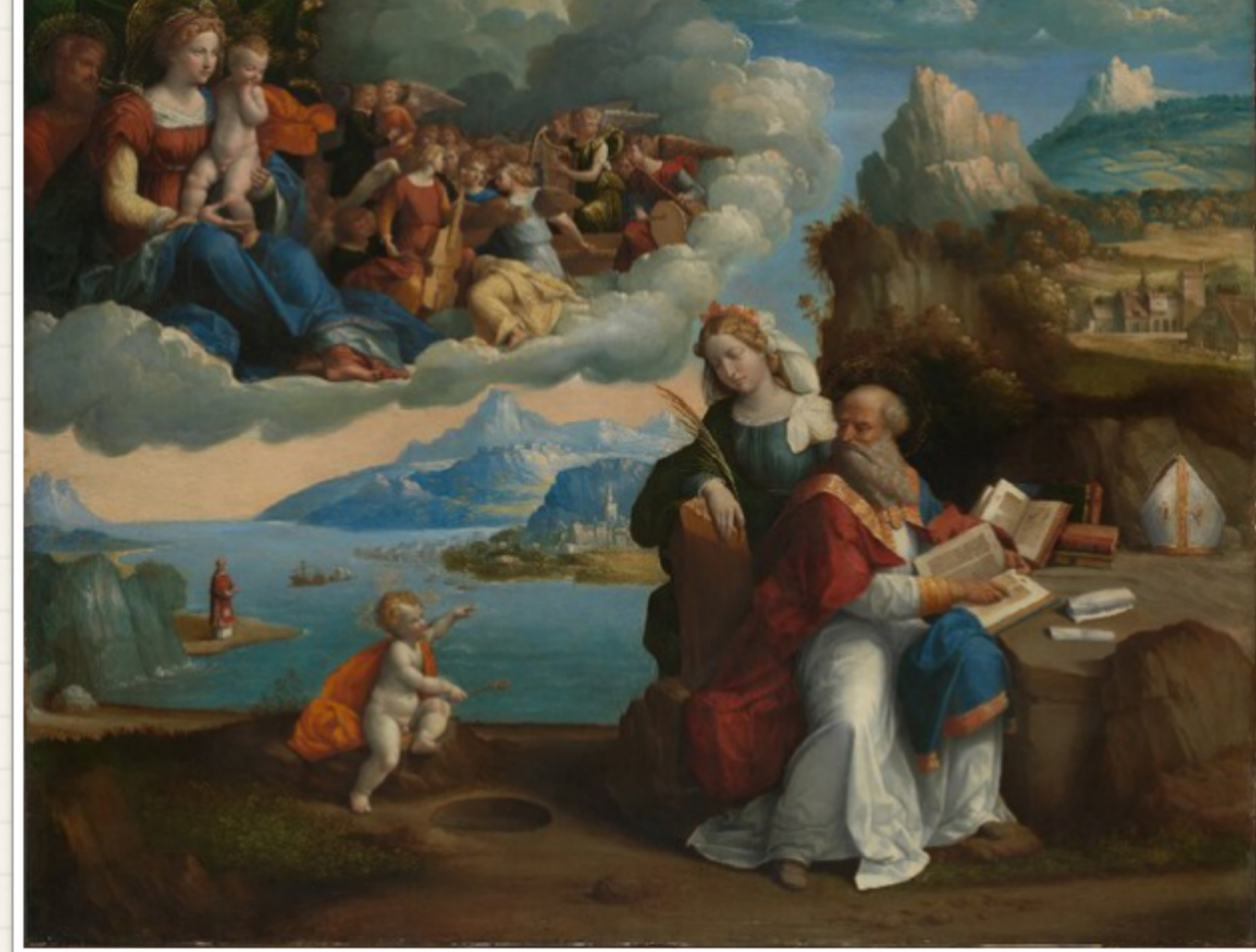
The Vision of Saint Augustine , Garofalo